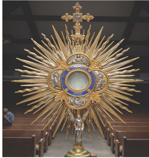
Learn more about the Year of the Eucharist in the Archdiocese of Boston at

www.bostoncatholic.org/yearoftheeucharist