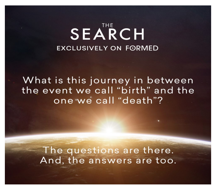
Why are we here? What's life all about?

Sometimes we get so caught up in the depth of our faith that we forget what it was like to first wrestle with the big questions—Who am I? What am I searching for? What's our shared story? Who is Jesus? Why do we need a Church? Is there a God? We all need to get back to the basics to make sure the foundation is strong.